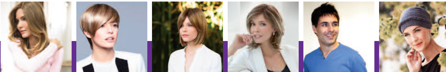
Selections from our wide range of custom wigs, hairpieces and accessories.